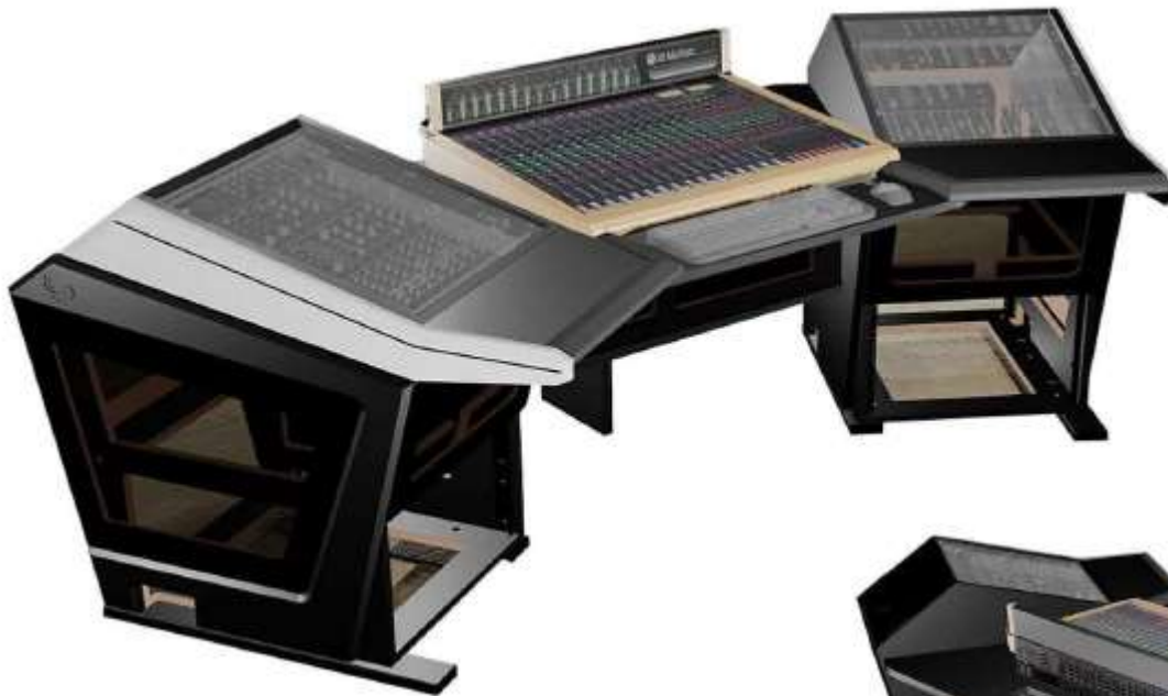
ATB 16 Shown