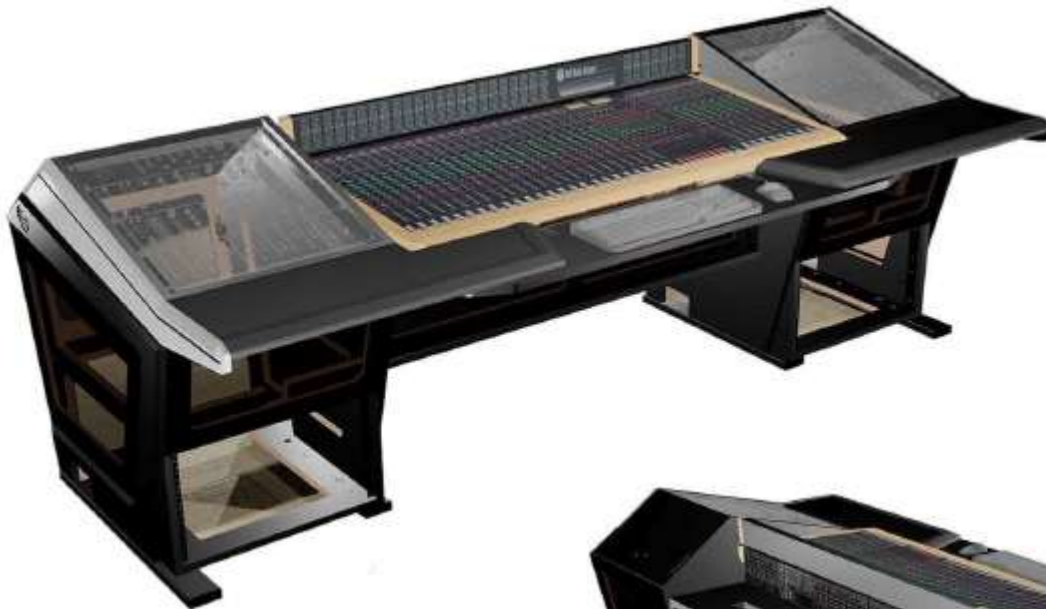
ATB 32 Shown